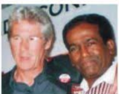
Richard Gere, Bangkok 2004 at International AIDS Conference.