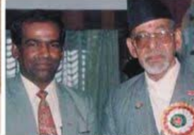
Manmohan Adhikari, 1994 Prime Minister of Nepal.