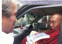
Dalai Lama, 2017, at Mumbai, presenting him "World Without Wars".