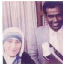
Mother Teresa, 1989 Nobel Laureate.