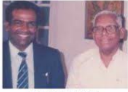
K.R. Narayanan 1992, Former President of India.