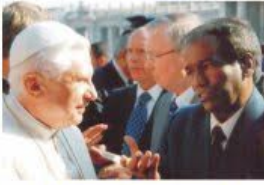
In animated discussion with Pope Benedict XVI at Vatican, 2006.