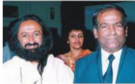
Sri Sri Ravi Shankar, Bangalore, 2003.