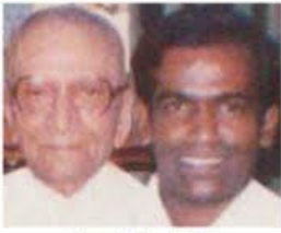
Morarji Desai, 1987 Former Prime Minister of India.