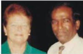
Dr. Gro Harlem Brundtland, 2002 DG-WHO, Barcelona, At International AIDS Conference.