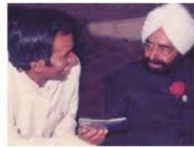
Giani Zail Singh, 1991 Former President of India.