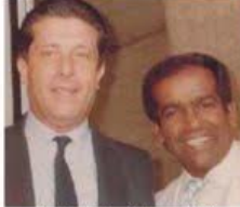
Dr. Federico Mayor, 1993 UNESCO-DG, Paris.