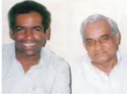
Bharat Ratna A.B. Vajpayee, 1991 Former Prime Minister of India.