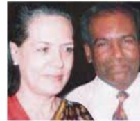
Sonia Gandhi, Bangkok 2004. At Intl. AIDS Conference.