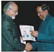
I.K. Gujral, 2003, Former Prime Minister of India.