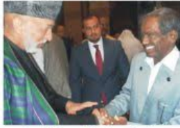
Hamid Karzai, 2016, at Bombay Former Afghanistan President.