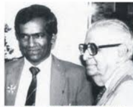
M. Hidayatullah, 1990, Chief Justice, Vice President & President of India.